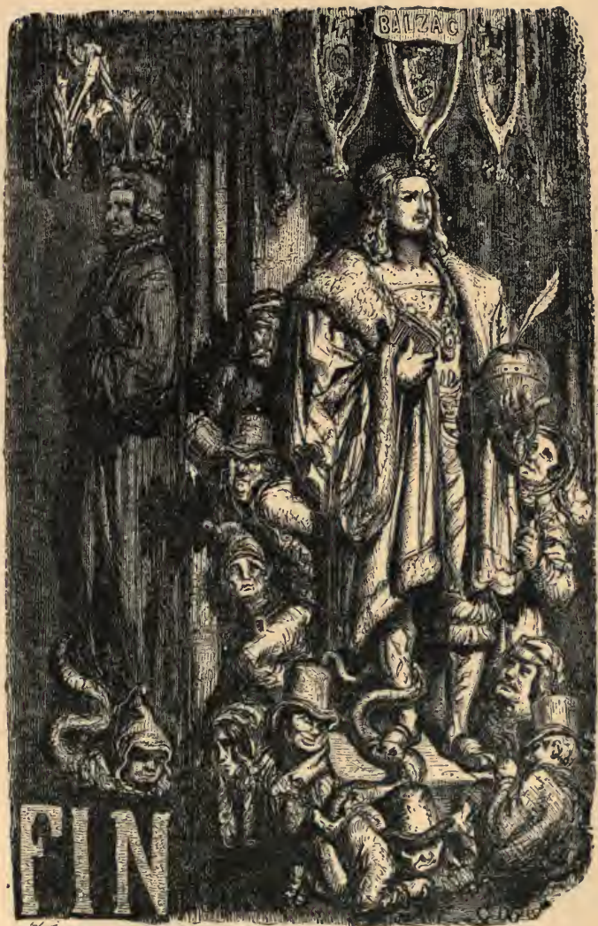
The Author of "The Human Comedy."